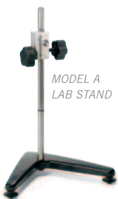
MODEL A LAB STAND

*Lab Stands with 18 inch rod assemblies are also available for testing with baths. Part Numbers for 18" stands: Model A 18, Model S 18