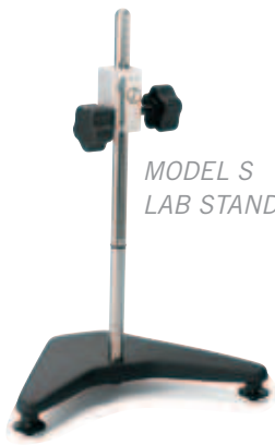
MODEL S LAB STAND