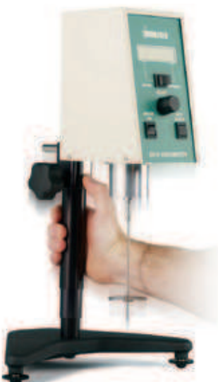
MODEL Q LAB STAND

Optional purchase for Dial, DV-E, DV-I Prime, DV-II+Pro & YR-1